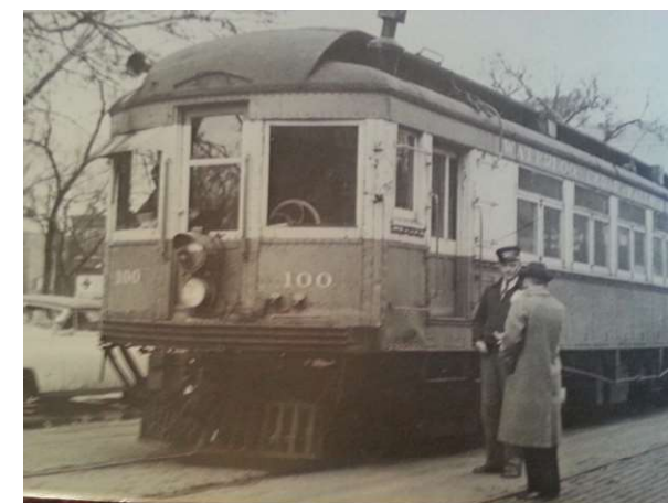
Trolley #100 in downtown Waterloo