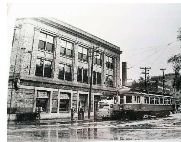
WCF&N Headquarters in Waterloo