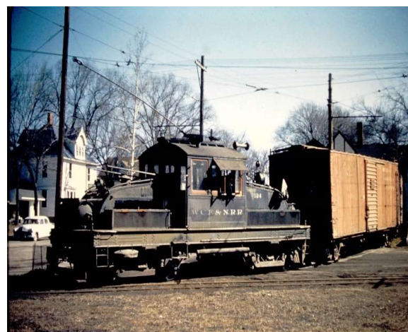
Freight train working through town